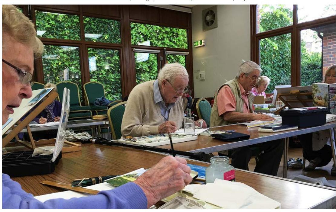
Monday morning Painting Workshop in action!