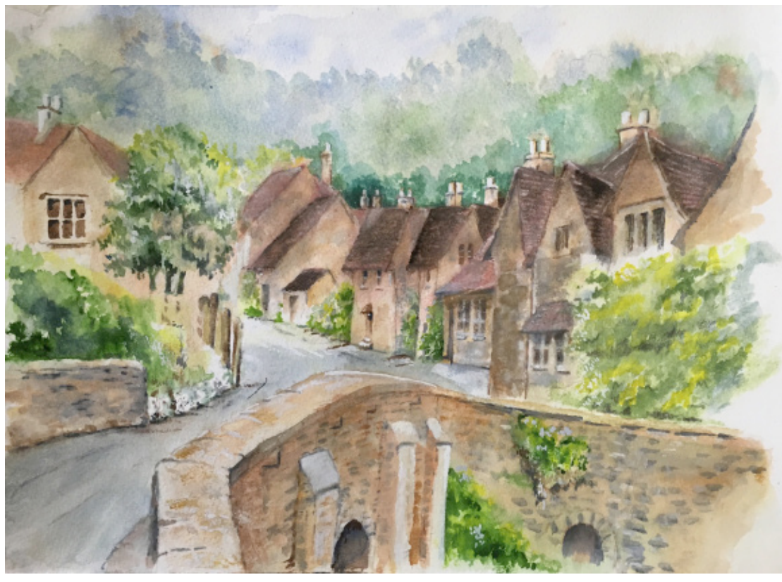
From a watercolour painting by Peter Brazier (one time editor of SM)